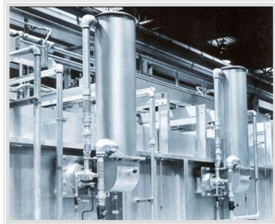
AFC-Holcroft EM-Style Recuperator