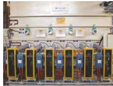
Main pusher mechanism designed specifically for heavy loads