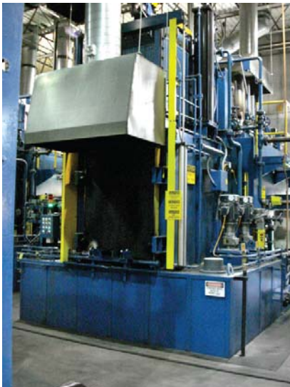
Based upon the performance of its other AFC-Holcroft furnaces, Flame Metals designed its wind-turbine program around an AFC-Holcroft integral-quench furnace.